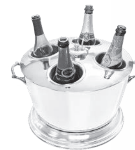
Royal Four #8314

For over 40 years, Franmara has been providing our customers with the finest quality, the best service and the most value with over 1,500 wine and bar products. Simply call or visit our website today. You're sure to find the best selling, innovative products.