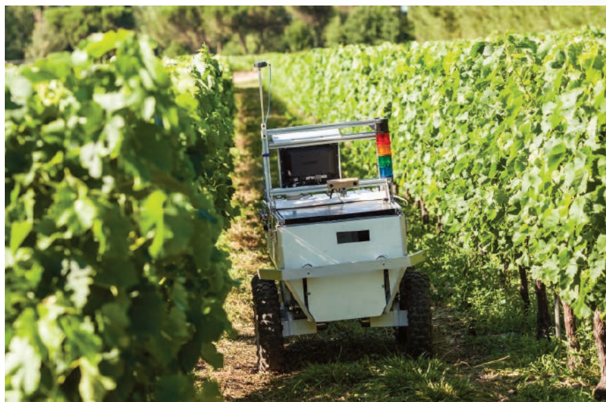
VineRobot is a multi-sensor scouting robot currently being tested in the Garonne Valley in Southwest France.

..... Comments? Please e-mail us at feedback@vwmmmedia.com