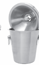
Half-Bottle Spittoon #9281SET