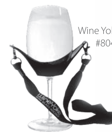
Wine Yoke #8044